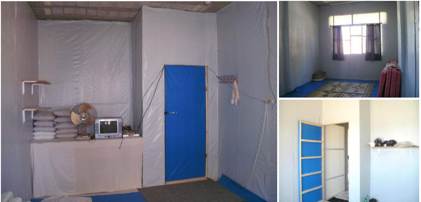
IOM provided emergency shelter upgrades for displaced households living in unfinished buildings, Rural Damascus.