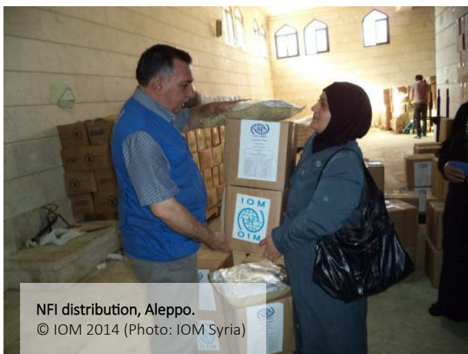
NFI distribution, Aleppo.

Since the beginning of the crisis, IOM has assisted a total of 2,000,890 IDPs in 14 governorates in Syria through the provision of 855,233 NFI kits .