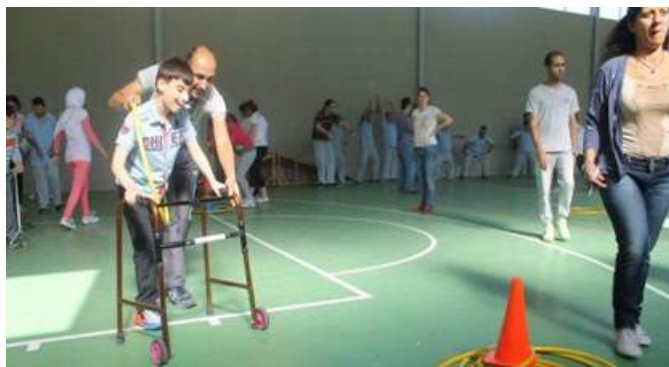
Training of Trainers session for individuals who work with people with special needs.

experiences with the trainees and explained the importance of sport in their psychological resilience and in overcoming some of the problems they faced.