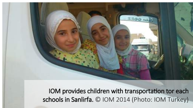
IOM provides children with transportation to each schools in Sanliurfa.

Since July 2013, IOM has provided transportation assistance to 51,075 beneficiaries .